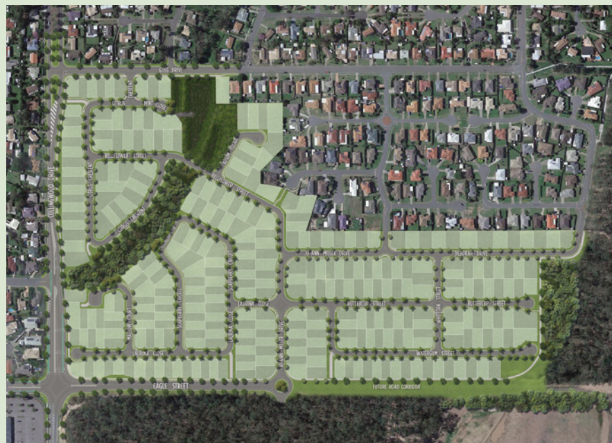
The Pocket Community Lot Plan

It's an invitation you're bound to hear, time and time again. In this close-knit community, kids will discover they're classmates, families will grow into lifelong friends, and the weekend BBQ will become an all-too-welcome routine. So go on. Bring the family. And settle into a lifetime of Sundays.